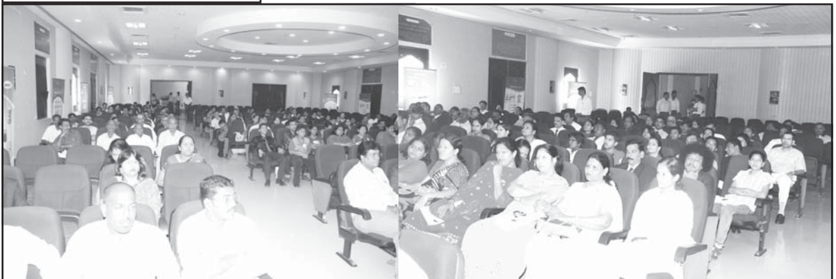
Guests and Distributors from across the Country listening attentively at the Launch ceremony.