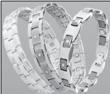
Neo Magnetic Bracelets